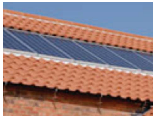
Six 175 W photovoltaic roof panels by Schuco

PV or Solar Electric is the application of solar cells for energy by converting sunlight directly into electricity. The PV cell consists of one or two layers of a semi conducting material, usually silicon. When light shines on the cell it creates an electric field across the layers causing electricity to flow. The greater the intensity of the light, the greater the flow of electricity. PV cells are referred to in terms of the amount of energy they generate in full sunlight, known as kilowatt peak or kWp.