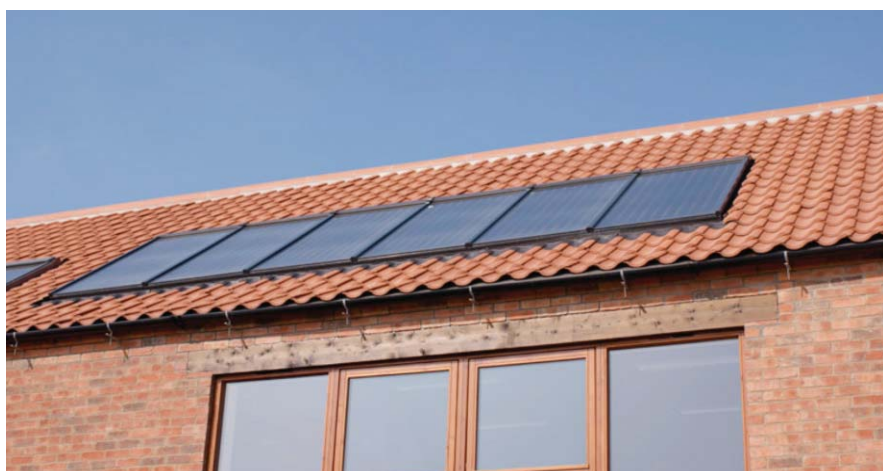
Six 1 kW solar heating roof panels by Hoval

Solar panels or collectors are fitted to roofs and collect heat from the sun's radiation.