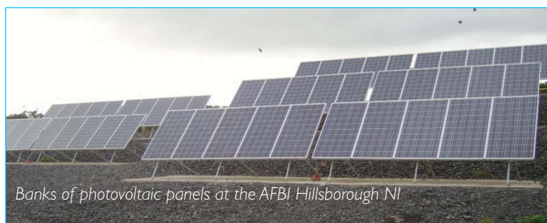
Banks of photovoltaic panels at the AFBI Hillsborough NI

Alternatively, technologies below 5MW will qualify for 'Feed In Tariffs' from April 2010. These will be paid for total electricity produced (Generation tariff) plus a supplement for electricity actually fed into the grid (Export tariff). In addition, money will be saved by not buying-in electricity off the grid.