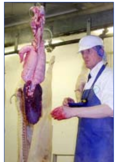
Carcass monitoring in the abattoir.